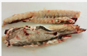
Backbones from splitting