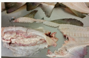
Backbones from filleting