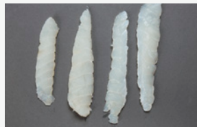
Loins (from backbone)